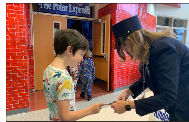
Boulton students board the Polar Express

community donations of gloves, hats, and scarfs. The tree was so full it broke the stand. All the donations will be going to The Safe Harbor Crisis Center this year.