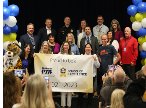
Tolman Elementary School of Excellence Award

• In the month of November, six student teachers were awarded $500 scholarships to go towards finishing their teaching degrees. The annual